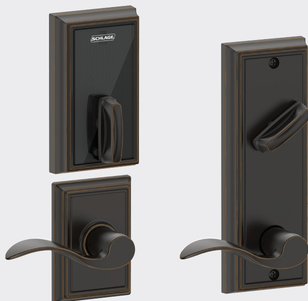
Schlage Control™ Smart Interconnect Lock with Addison trim in Aged Bronze with Accent lever