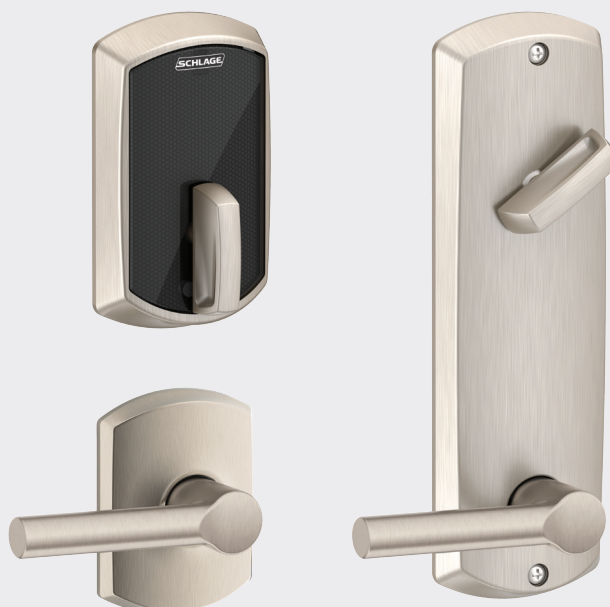
Schlage Control™ Smart Interconnect Lock with Greenwich trim in Satin Nickel with Broadway Lever